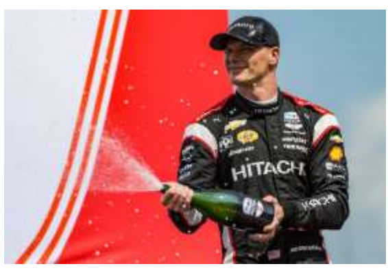
Josef Newgarden scored four wins in the INDYCAR 2023 season.